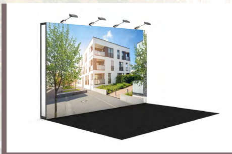
View complete stand VARIO