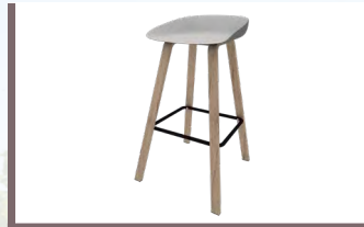
Bar stool „Bari“ € 88,90/piece