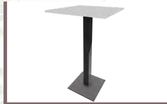
Bar table „Lifestyle“ € 86,50/piece