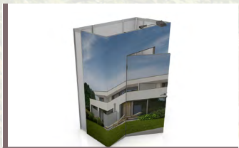
Box h x b x d 2500 x 2020 x 1030 mm