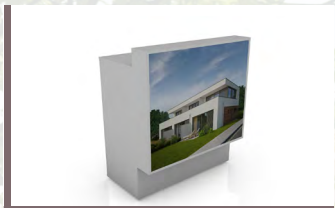
Bar „Fabric“ Bar „Luminar“ backlit h x b x d 1120 x 990 x 620 mm