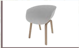
Chair „Bari“ € 88,90/piece