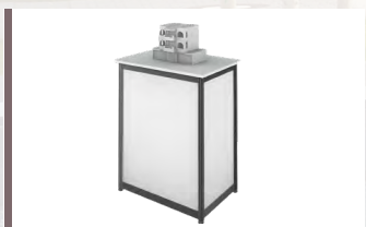
Podests (dimensions h x b x d)