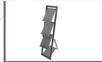
Brochure stand € 95,20/piece