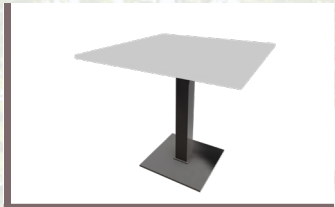
Table „Lifestyle“ € 71,20/piece