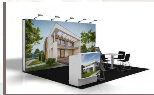
View complete stand VARIO with furniture